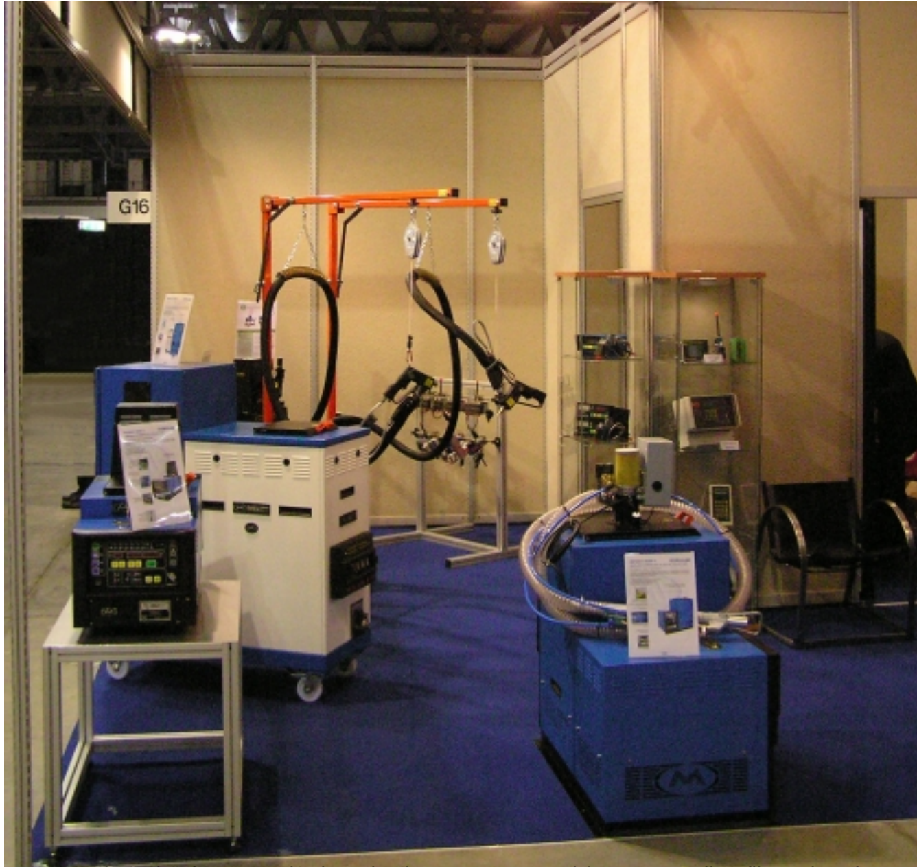
Also various boards of our standard production were exposed (power supplier, filters, interfaces, e