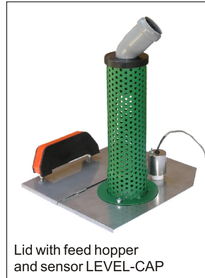
Lid with feed hopper and sensor LEVEL-CAP